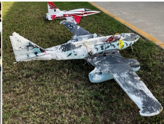
Anybody lose this?