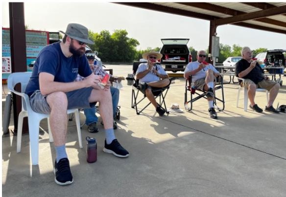
Water melon Time