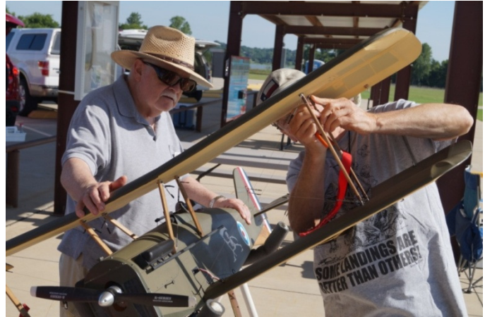
Three Days Later- % ## &*

moments after you disregarded that "patrolled by aircraft" sign