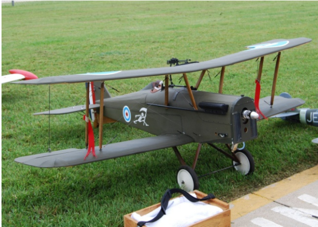
Bi-Planes are a real joy-.....